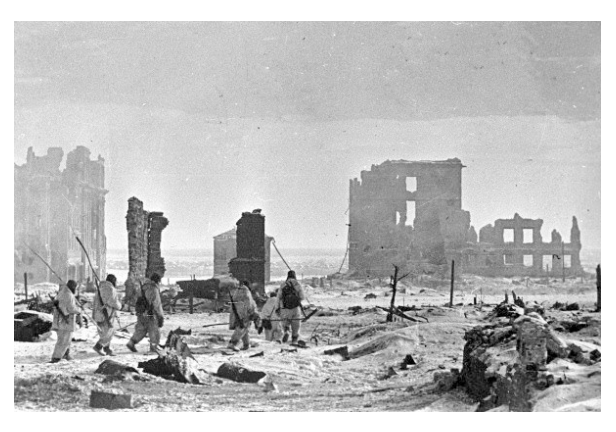
The Battle of Stalingrad is considered to be the largest single battle in human history