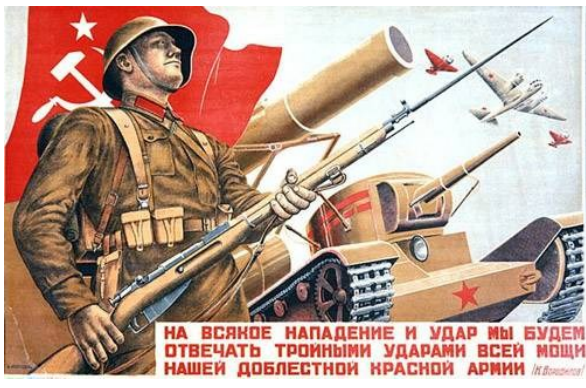
A Soviet propaganda poster from World War II.

Russia celebrates Victory Day each year on May 9. The event includes huge parades and is often an opportunity to debut new military equipment. Soviet victory over Nazi Germany remains a major source of national pride. Victory Day is no longer an official holiday in some former Soviet Republics that have tense relations with Moscow and has been replaced by other ceremonies.