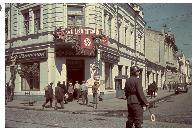
German soldiers occupy Kharkiv in eastern Ukraine.

Stalin reversed some of his international communist rhetoric in an attempt to stir up Russian nationalism, claiming the Red Army was fighting a "Great Patriotic War," a name that invoked the Russian Empire's defeat of Napoleon in 1812.